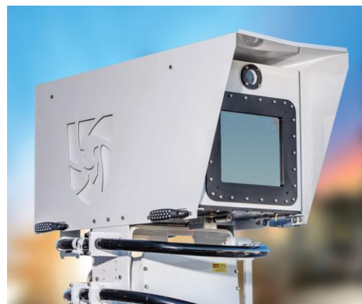
Honeywell Rebellion GCI is a state-of-the-art, robust solution for the harshest industrial environments.