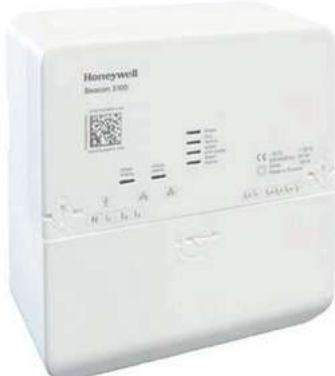
Beacon 3100 Data Concentrator