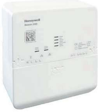
Beacon 3100 Data Concentrator