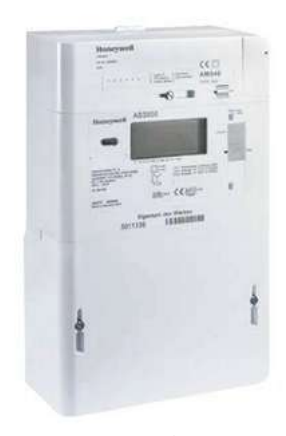
AS3000 Electricity Meter Connected to AM540 Communication Module